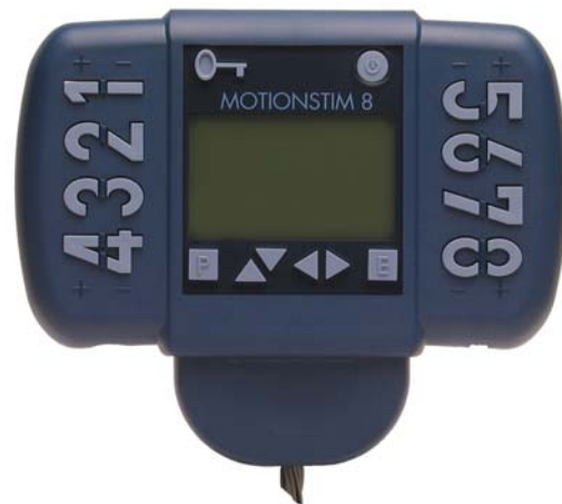
Figure 1: Stimulator MOTIONSTIM8

Heart of the Stimulator is a Hitachi 32 Bit microcontroller (H8S/2633, 4MB RAM, 11